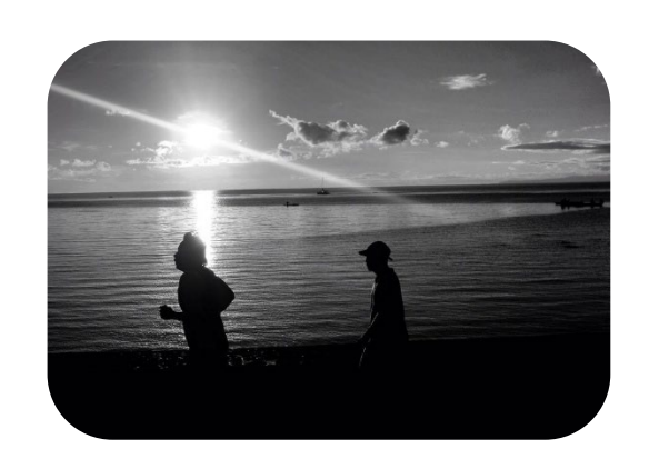
Quiet the ego